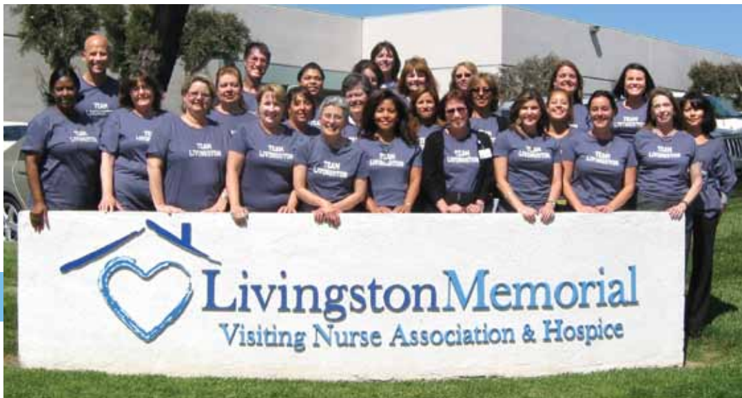
Livingston’s Staff Giving campaign was joined by 104 Livingston Team members who contributed a total of $16,617.

In 2010 we put in place a formal Staff Giving Program. The program was designed to increase participation, give appropriate recognition, and help with team building. The results should not have surprised us. We had nearly 55% participation: 104 staff made gifts totaling $16,617. Eight made gifts at the Distinguished Donor level and five joined our Legacy Society, see Giving Clubs pages 11-12.