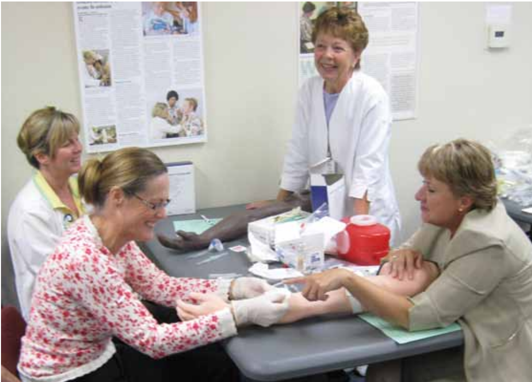
Continuing Livingston staff education plays an important role in delivery of high quality patient care.

You came to my home for treatment of my leg ulcers, as well as complications from diabetes and other health issues. I would like to thank you for your kind assistance, and express my appreciation for the wonderful nurses that came to visit me and take care of my legs. —THOUSAND OAKS PATIENT