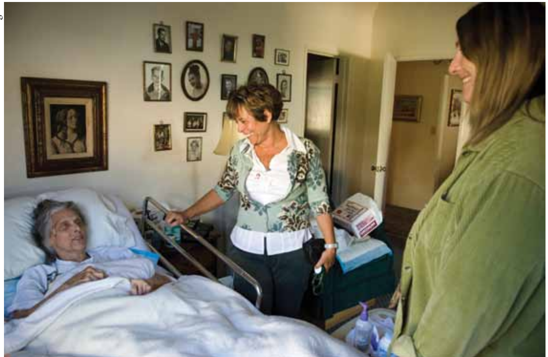
Livingston Hospice meets the needs of both patient and family members.