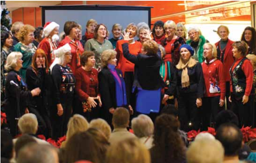
The ChannelAire Chorus raises its voice for 25 years of Light Up A Life celebrations.