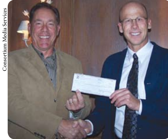
Consortium Media Services